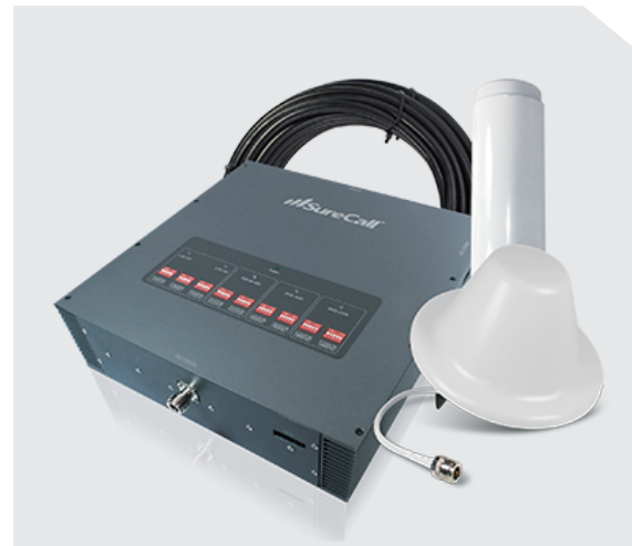
The SureCall Force5 kit featuring the Omni and dome antennas.